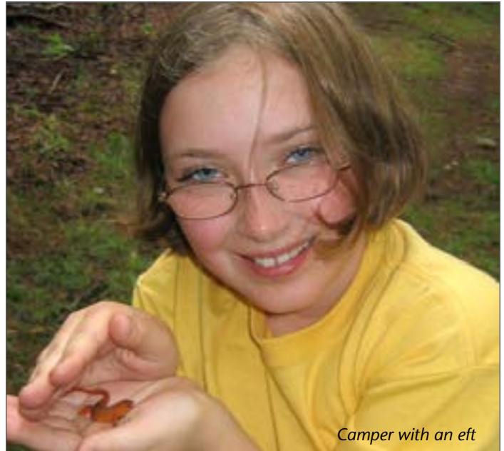
Camper with an eft