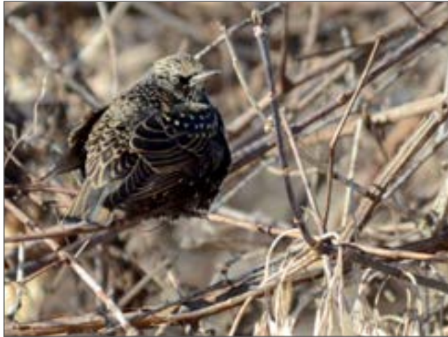
Starling, by Dave Kiehm

These three species are interlopers; none are native to eastern New York, and only the cowbird is native to North America, where at one time it was found primarily in the short-grass ecosystem of the western plains. Here cowbirds mingled with herds of bison and later of free-range cattle, feeding on the insects stirred up by millions of hooves. Cowbirds