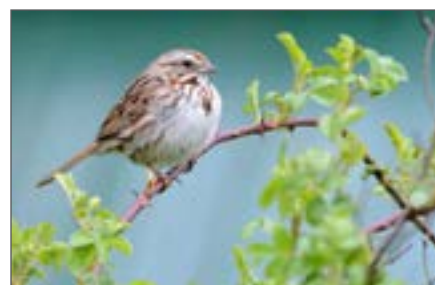
Song Sparrow, by Dave Kiehm

Mercury exposure is, of course, a risk for people as well as wildlife; humans, however, can control their mercury intake while wildlife cannot choose to avoid eating mercury contaminated prey.