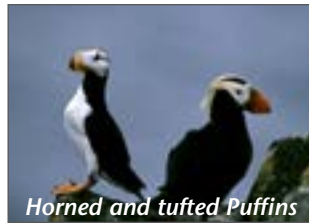
Horned and tufted Puffins