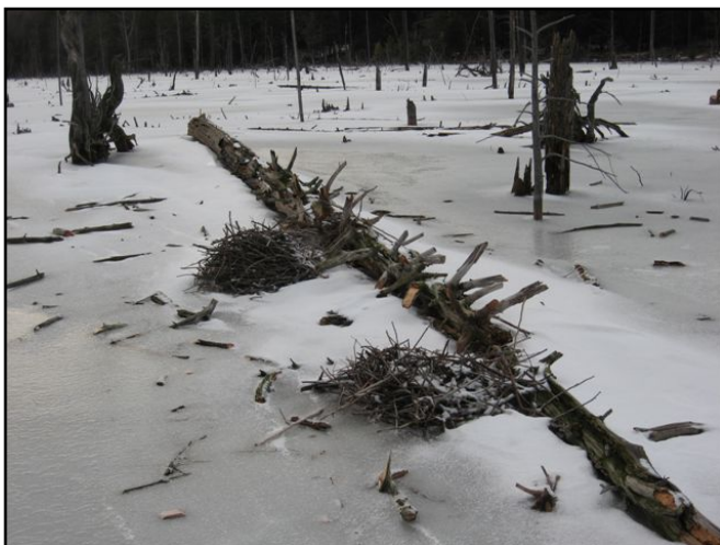
Felled tree and heron nests at the active rookery

This pond is at the juncture of several properties. Some of the property owners are enraged by this destructive act which left only a few nests standing in the pond. We have reached a verbal agreement with one landowner to allow us to use his part of the pond to construct steel structures with nesting platforms. The platform design has been successfully used in New Hampshire. If we can formalize the agreement in a meeting with the landowner on February 24, we intend to act to complete this project before the ice melts. We hope that providing nest sites will mitigate the damage.