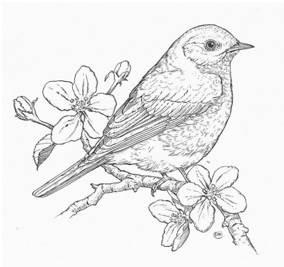
Eastern Bluebird

Non-profit Organization US Postage Paid Bulk Mail Permit #208 Oneonta, NY 13820-0544 Address Service Requested