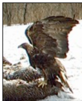
Local Golden Eagle, via wildlife camera.

Golden Eagles are found throughout the northern hemisphere. In New York State they appear in our region in greater numbers than anywhere else. These iconic birds of prey are widespread; however, little is known about the small eastern North American population which some researchers believe to be genetically distinct. In NY and among eastern hawk watchers, these birds have been closely