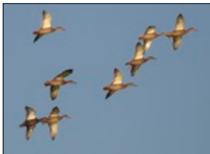
Mallards with a Black Duck