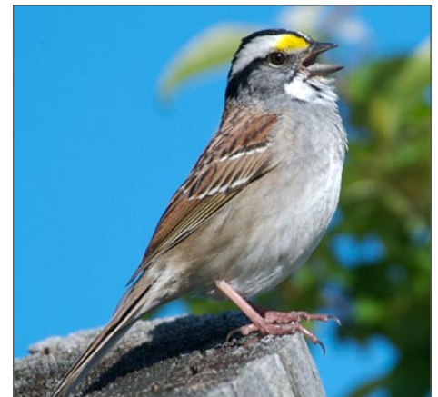
White Throated Sparrow