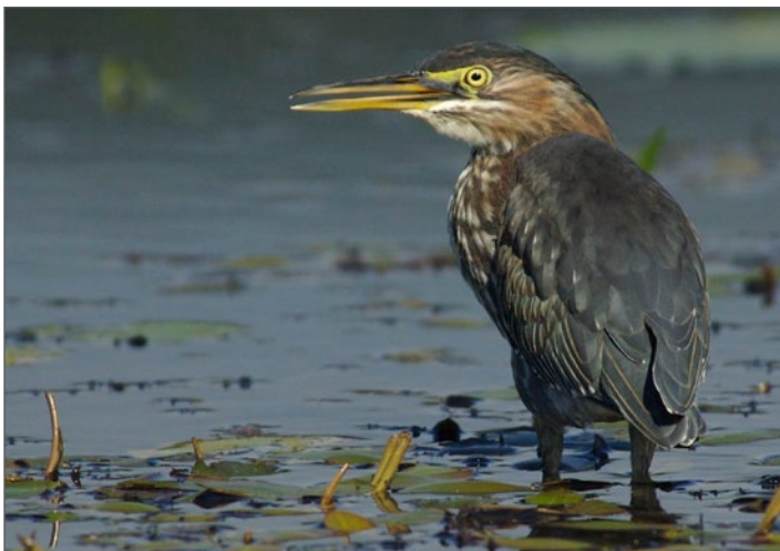
Green Heron from Weaver Lake