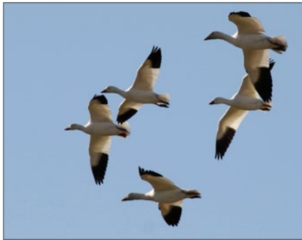
Snow Geese