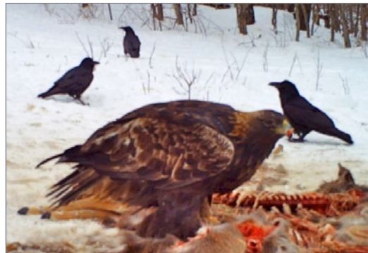
A Golden Eagle feeds at one of our monitoring sites

The program is free and open to the public. Refreshments are served. For further information contact: Eleanor Moriarty: 607-435-2054 or 607-278-4083