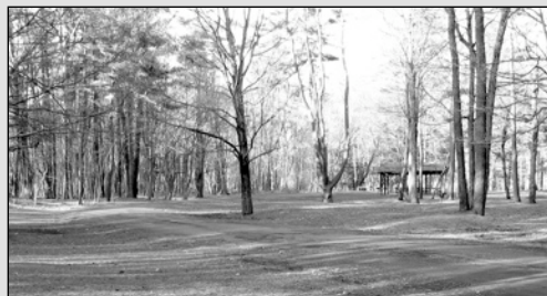
Wilber Park, Oneonta

extensive trails on the hill above the large pavilion yields various thrushes and warblers, and an occasional surprise such as a Nashville warbler, a raven or an owl. If you extend your walk to include a trip around the high school, you'll