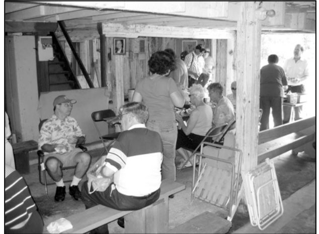
Over 20 members of the St. James Episcopal Church enjoyed a picnic lunch in the barn at the DOAS Sanctuary on August 16th. The St. James Church has owned the Sanctuary property since 1965, with DOAS managing it since 1980.