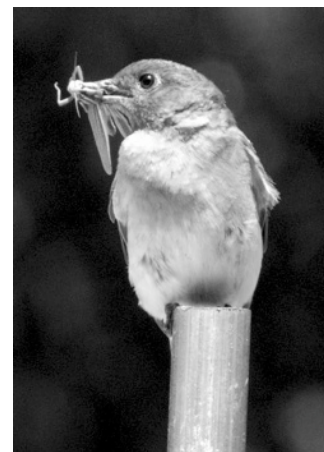
Bluebird