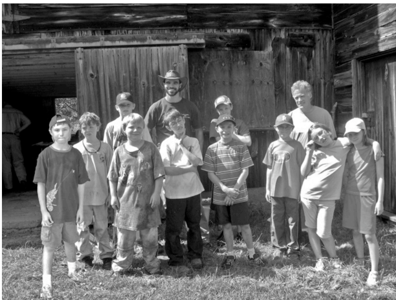
2009 campers and camp leaders

Special thanks to the Clark Sports Center for the loaning of six GPS units.