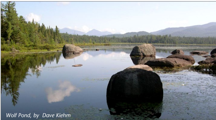
Wolf Pond