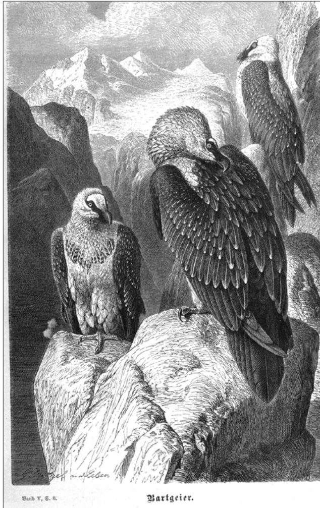
Lammergeier from Brehm's Tierleben Volume 2 birds

The High Pyrenees are a great destination for anyone passionate about raptors.