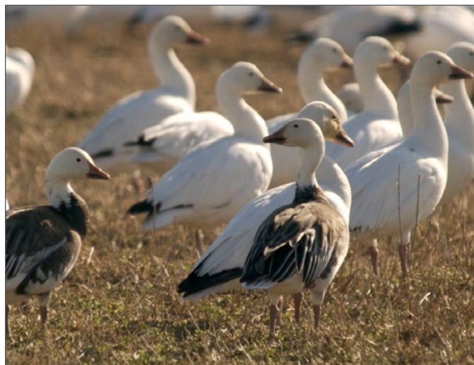
Snow Geese at Montezuma