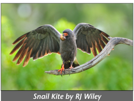
Snail Kite