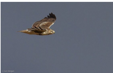
Northern Harrier at FMHW

Broad-winged Hawks made an especially early showing at the Franklin Mountain Hawkwatch this year. Always the first species to move in significant numbers, broad-wings migrate to