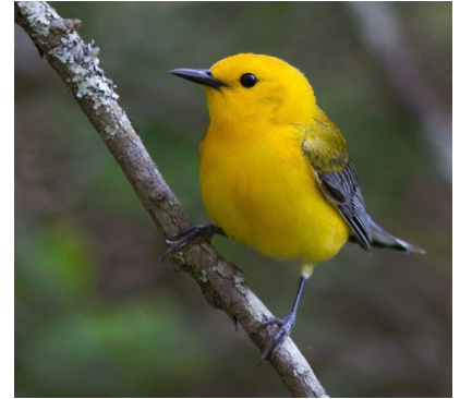
Prothonotary warbler

We especially encourage those who have served as members of the Board or officers of DOAS over our fifty years to join us to celebrate our anniversary.