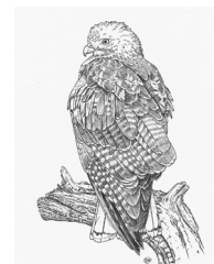
Red-tailed Hawk