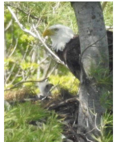
Treadwell Eagles

Monday, March 14th arrived, bringing a severe snowstorm. Treadwell was buried under more than 30 inches of snow. I was very concerned for the wellbeing of the eagles, but it was Thursday before I finally saw them – together, sitting in a tree along the creek, just below my barn. It was cold out, below freezing, and in such weather, I was sure the eagles would not both leave the nest at