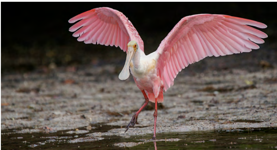
Roseate Spoonbill Audubon