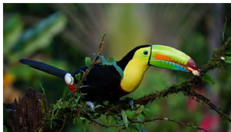
Keel-billed Toucan, CCO