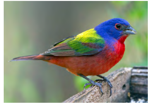
Painted Bunting

Waking up on my first morning in Naples, I heard a mix of bird calls that stumped me, and it took me days to figure out that the slightly electronic-sounding calls and rattles coming from the surrounding palm trees were made by boat-tailed grackles. The birds I saw at the nearby beach and along the Intercoastal Waterway--great blue herons, anhingas, white ibis, pelicans, great frigatebirds, willets, ospreys--were more familiar. I lived in Key West just out of college, and camped and traveled in Florida over the years, so I knew from notes in my circa 1987 bird book that I'd previously identified most of the birds I encountered (including those grackles). But, like the novels I inadvertently re-read, sometimes it's a whole new