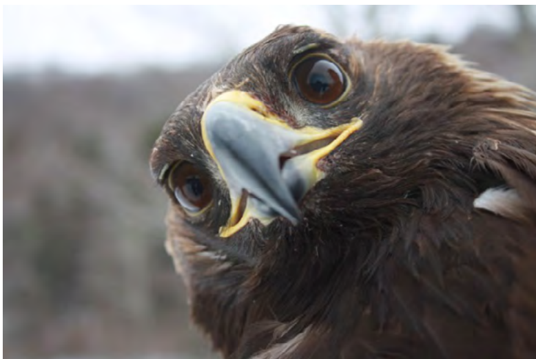
Sisu, Golden Eagle