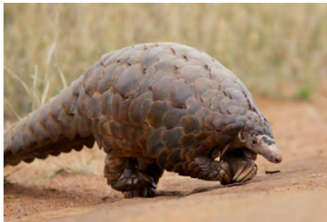
Pangolin

Increasingly, trade in wildlife—often illegal—is seen as a route for these diseases from animals to humans. A recent paper in the journal Nature found evidence that a small proportion of pangolins carry coronaviruses related to the strain responsible for the COVID-19 pandemic. Pangolins are endangered, scaly, ant-eating mammals found in Asia and Africa, about the size of domestic cats. Although international commercial trade of pangolins is strictly forbidden, they are believed to be the most trafficked mammal in the world. The scales of thousands of pangolins are smuggled every