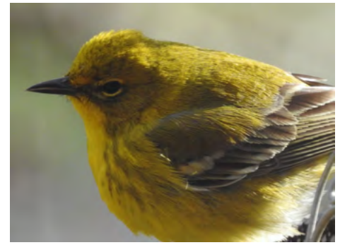
Pine Warbler