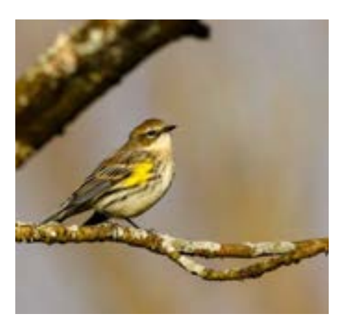
Yellow-rumped Warbler

I was among those who found being outside a welcome option. I traded breakfast get-togethers for socially distant walks; and DOAS-led birding trips and the Birding by Ear event for online webinars and frequent treks into local state parks and preserves. At the same time, I was becoming involved with the Breeding Bird Atlas. While I didn't take responsibility for a 'block,' I regularly