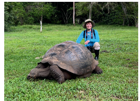
The Author and Friend