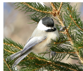
Chickadee Feeding

our area. For more information about Christmas Bird Counts go to https://www.audubon.org/conservation/science/christmas-bird-count