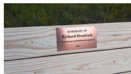
Plaque on new bench at Hawkwatch