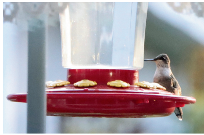
Rufous Hummingbird

area...I suspect he is in migration” and a first-year male Common Yellowthroat, “you can see the shadow of what will become his black mask”. Later in the month he found five sparrow species, including Lincoln’s Sparrow.