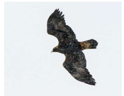
Golden Eagle

The loudest and often most alluring bird vocalizations are for the purpose of attracting mates and defending territory. That business is mainly a summer enterprise though, and, as one walks along a woodsy path now, it’s easy to think the birds have mostly disappeared but for the call of a jay or a scolding crow. Yet birds are there for the careful observer. Charlie Scheim and I hiked the main loop at the Texas School House State Forest and were rewarded with 11 species, including two skulking, silent Wood Thrushes, several quietly calling Golden-crowned Kinglets, one agitated House Wren, and, at the end of our hike, a Blue-headed Vireo bidding us farewell with his cheery song.