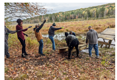
SUNY Delhi's NECA Chapter in Action