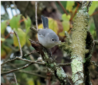
Blue-gray Gnatcatcher

I have always been impressed with the depth of knowledge required to identify less common birds and the non-breeding plumage of warblers. Rick Bunting is a birder with the patience and fortitude to spend many hours watching wildlife, waiting for good photo-ops, and finding those subtle markings that identify a species. Many of the images he posts, mainly from the Unadilla area, show details hidden to the casual observer. In mid-September he posted photos of a Blue-gray Gnatcatcher, “uncommon in our