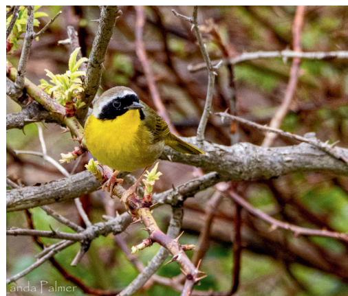
Common Yellowthroat (above) and Black-throated Green Warbler (below)

We ended up with 22 species, from Brown Creeper and Wood Thrush to Black-throated Green Warbler and Winter Wren, whose magical song thrilled the group. A Scarlet Tanager singing atop a bare ash tree was a nice finale as we returned to the parking lot. It was too wet to venture up to the newly constructed fire tower. Save that for another time! An ebird checklist from the walk can be found here: https://ebird.org/checklist/S233923707 .