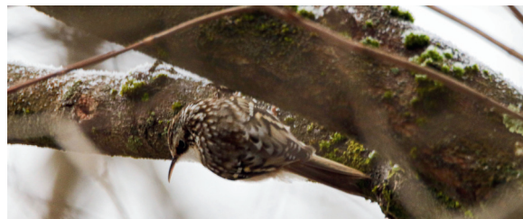
Brown Creeper

Please refer to the website for more details on the options - from dark roast to light roast to decaf - that are available, and how to order. Coffee sale proceeds support DOAS programs.