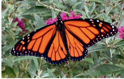
Monarch Butterfly

Unfortunately, the current administration has cut funding for many