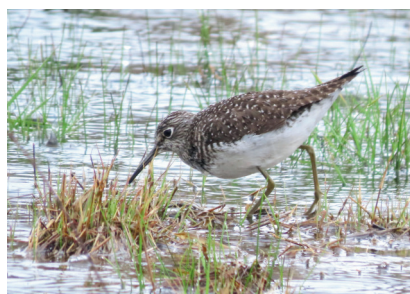
Solitary Sandpiper