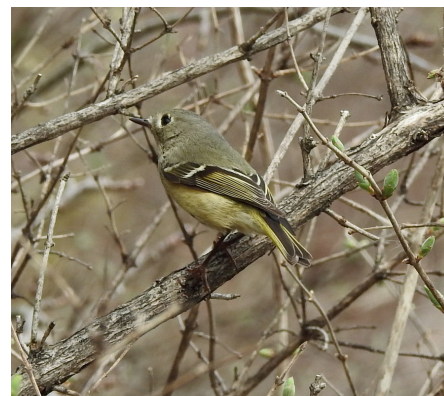
Ruby-crowned Kinglet