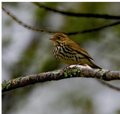
Ovenbird