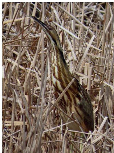
American Bittern