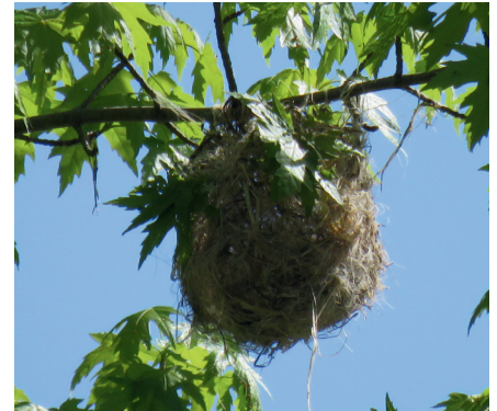
Baltimore Oriole Nest

Flycatcher, five warbler species, and two “first of season” species, Scarlet Tanager and Wood Thrush. The highlight of the trip was the show put on by a male Baltimore Oriole, who paid his human audience no mind as he worked on construction of a nest overhanging the raging river. This was unusual in itself, as it’s generally the female that builds the nest. The most fascinating aspect, though, was that, while the nest was solid and stable, it was still so loosely-woven that we could